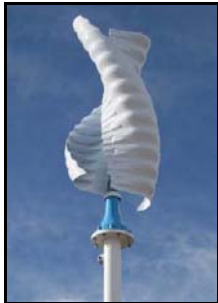
Fig. 6 Helix Wind S322