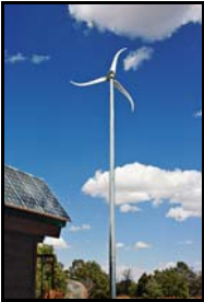
Fig. 1 Southwest Windpower Skystream 3.7