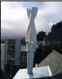
Fig. 5 Blue Green Pacific Wind Turbine