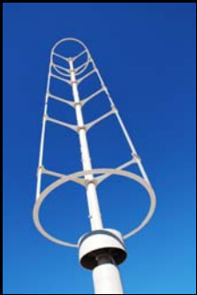
Fig. 3 Mariah Power Windspire