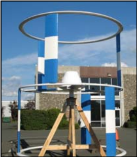
Fig. 4 Wind-Sail 3kW