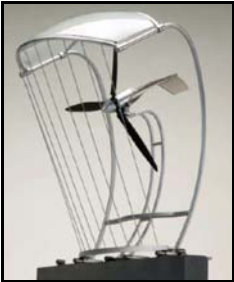
Fig. 2 AeroVironment AVX1000