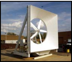
Fig. 7 Green Energy Technologies WindCube