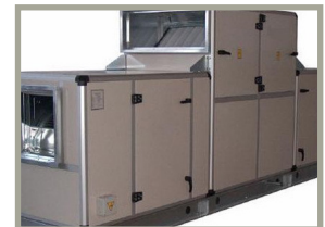
MAINTENANCE AND REPAIR