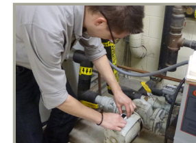
TUNING UP EQUIPMENT