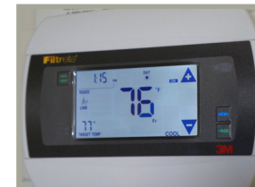
HVAC SETPOINTS AND CONTROL SCHEMES