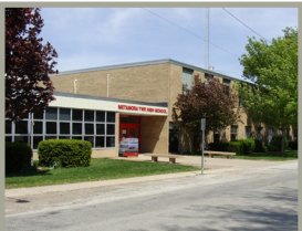
PUBLIC SCHOOLS, COLLEGES, & UNIVERSITIES