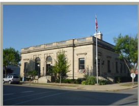
MUNICIPALITIES & LOCAL GOVERNMENT