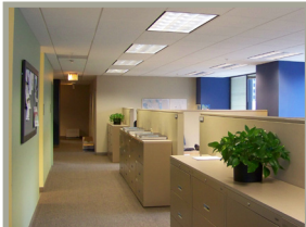
FEDERAL & STATE BUILDINGS