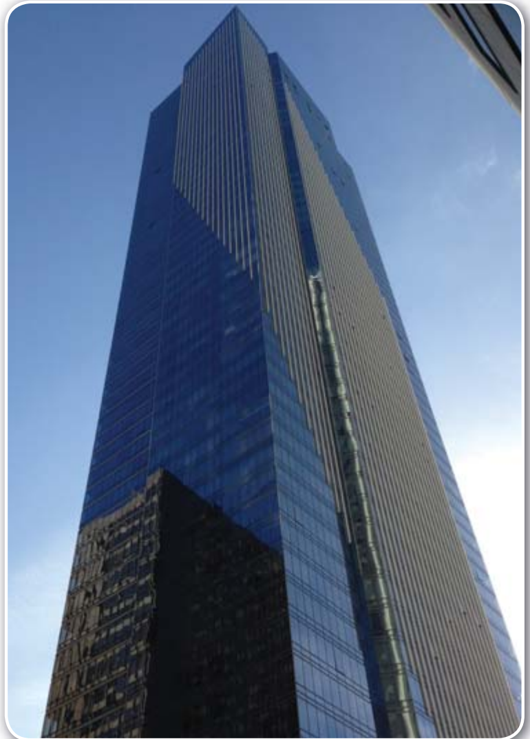
Millennium Tower in San Francisco installed PEV chargers for their tenants. See Appendix D in the Plug-in Electric Vehicle Charging Infrastructure Guidelines for Multi-unit Dwellings to read this and other case studies for MuD charger installations.