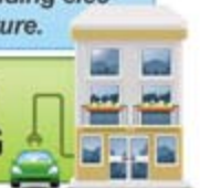
Figure 1. Typical PEV charging station installation process flow in MuDs.

MULTI-UNIT DWELLING PEV DRIVERS START CHARGING